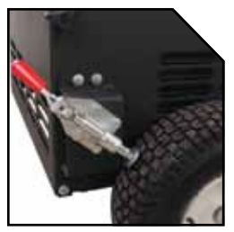
Locking rear wheel brake prevents unit from rolling