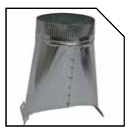
Optional stack adapter allows 8-inch flue pipe to be installed to vent machine exhaust