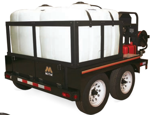
AW-9000-0003 has storage area located under water tanks