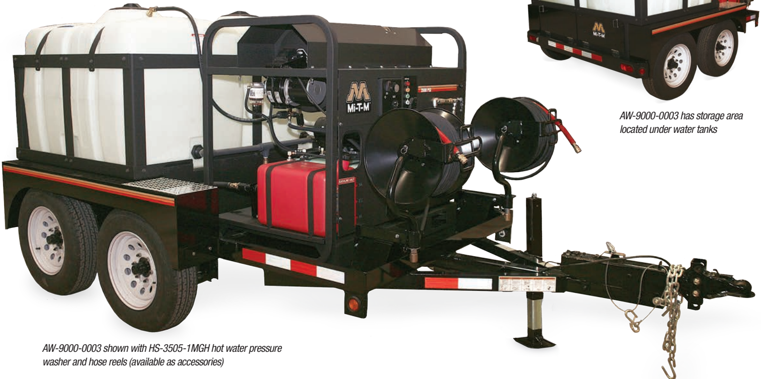
AW-9000-0003 shown with HS-3505-1MGH hot water pressure washer and hose reels (available as accessories)