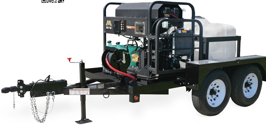
AW-9000-0008 shown with TX-0010 trailer hitch and HS-3006-OMDK hot water pressure washer and hose reel (available as accessories)